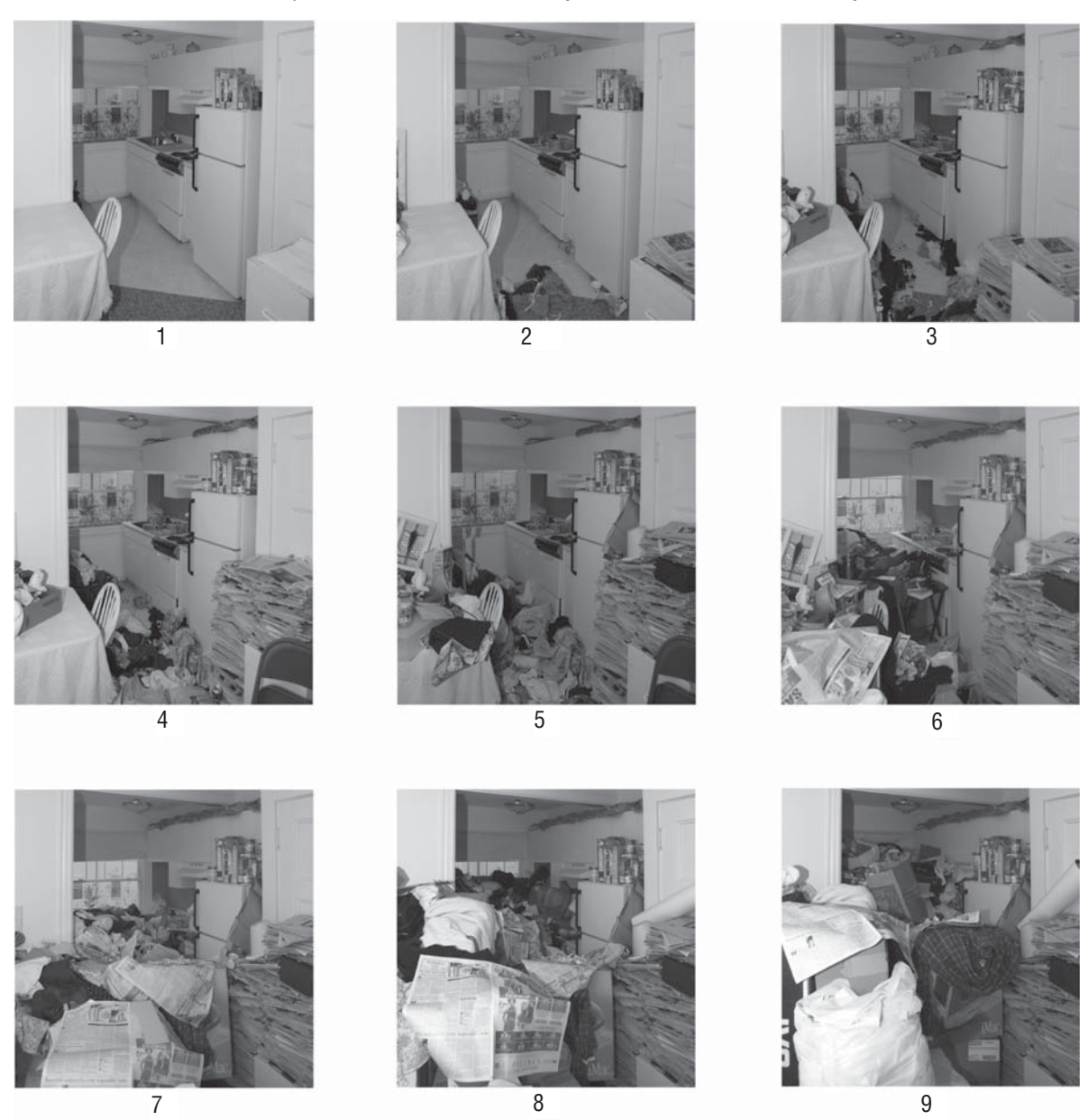
Figure 2.2 Clutter Image Rating Scale: Kitchen

Please select the photo below that most accurately reflects the amount of clutter in your room.