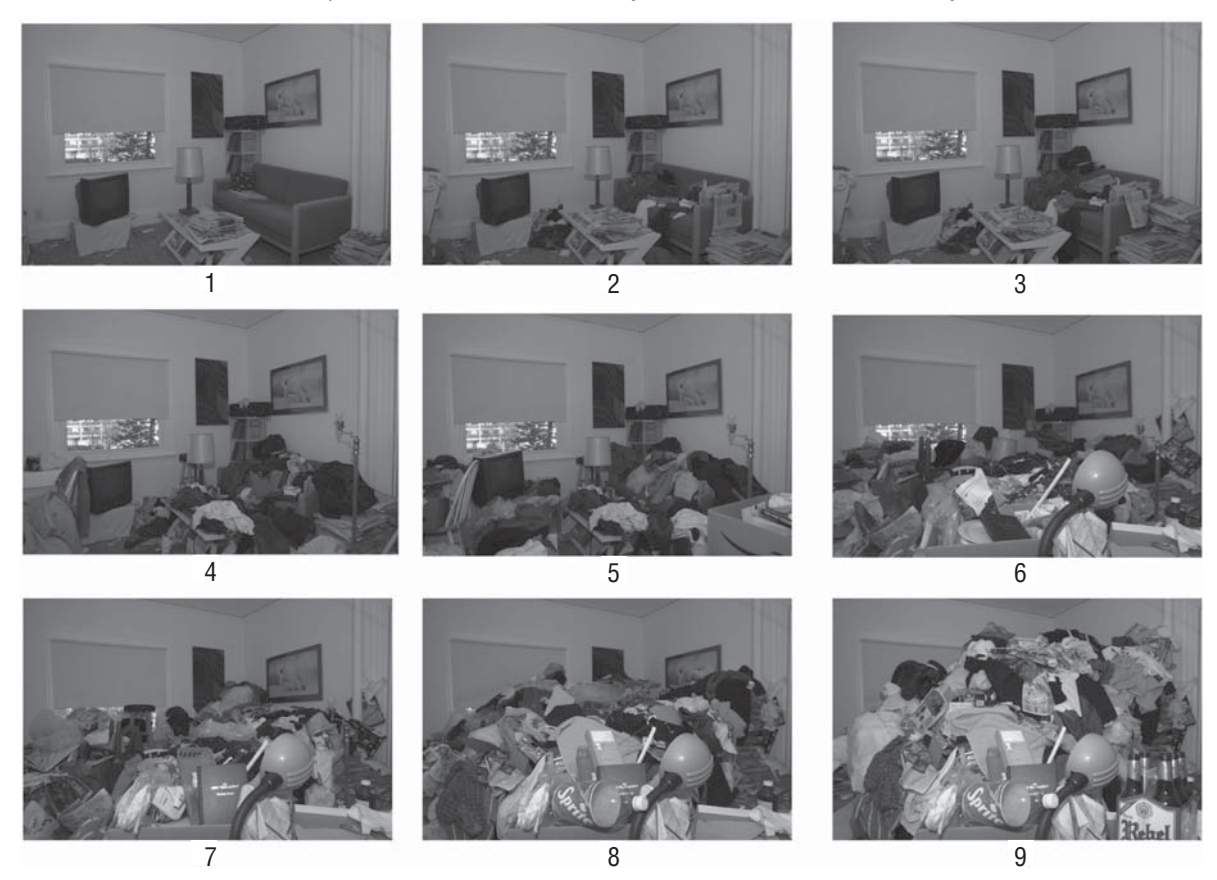
Figure 2.1 Clutter Image Rating Scale: Living Room

Please select the photo below that most accurately reflects the amount of clutter in your room.